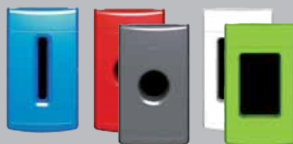
slot hole open